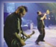
The O.C. Supertones had throngs of young people celebrating