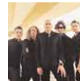
Newsboys Million-selling artists and worship leaders