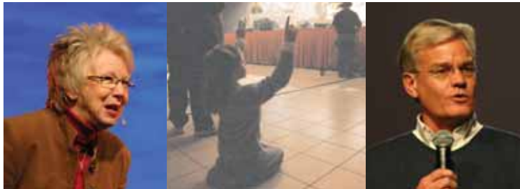
Patsy Clairmont had us rolling in the aisles; Worship across generations; Bill Hybels called us to faithful leadership

We have so many quotes from people whose lives were touched in great ways. Here is just one of the many: