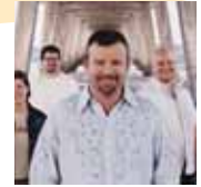
Casting Crowns #1 Christian band