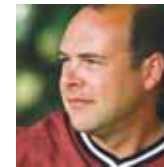
Brian Doerksen Writer of many top praise songs