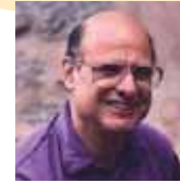
Tony Campolo Dynamic speaker and author