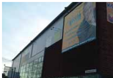
The rally arena in Finland

Over the years, we have been very active in Finland. We are now working with the Nokia Mission in Tampere, Finland, where we will hold a televised evangelistic rally and a pastor's training day.