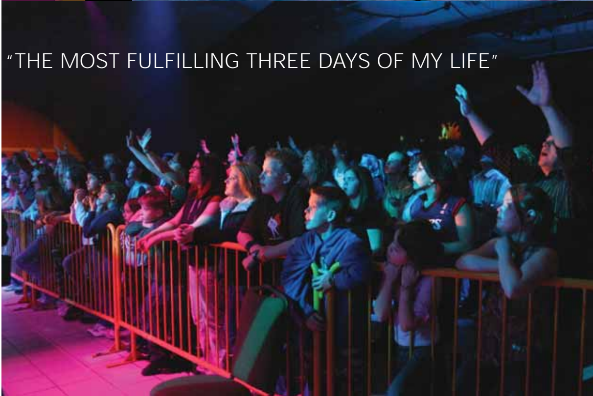
It was thrilling to see so many young people, parents and grandparents at Break Forth Canada 2006.