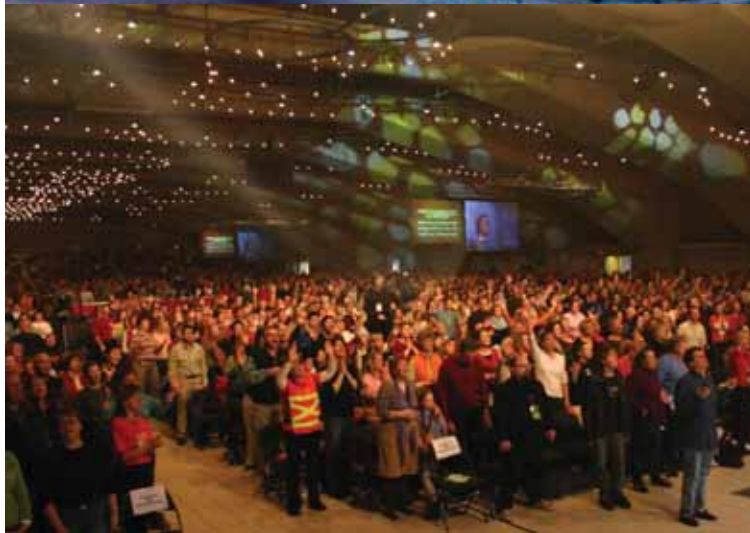
Thousands across denominations, ages, races and preferences join their voices in worshipping the one true God. A glimpse of heaven!

God was at work in thousands of hearts at Break Forth Canada 2006. Here are a few photos to give you a glimpse into what He accomplished: