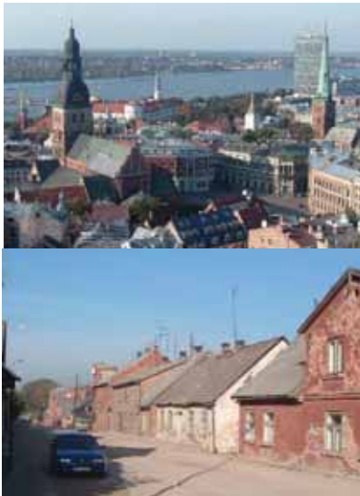
Overlooking Riga (top) Streets in Latvia. (bottom)

Please pray for a powerful move of God at Break Forth Latvia.