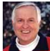
Josh McDowell Author, speaker, apologetist,