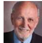
Stuart Briscoe Exceptional men's ministry